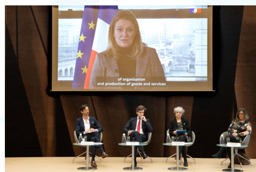
The international event of the 4th of March, 2022 gathered more than 200 people online and in person.

Since March 2022: Working groups dedicated to the UN resolution proposal on SSE.