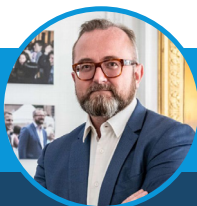
CHRISTOPHE ITIER, High Commissioner for Social and Solidarity Economy and Social Innovation, France

Pact for Impact's ambition is to build a global alliance of states, governments and local authorities, institutions, networks, NGOs and companies for the development of the social and solidarity economy, the Inclusive Economy and Social Innovation. Facing the many present and future social and ecological challenges - climate change, fight against inequalities, migration, food security, demographic transition, access to health and education ... - we have the will to create a new coalition with all the state stakeholders and the civil society, to bring to the highest level a political vision, strong commitments and concrete measures, to accelerate the development of the social and inclusive economy at the global level, in order to expand solutions it brings to the local level, and to make it a pillar of the economy of tomorrow.